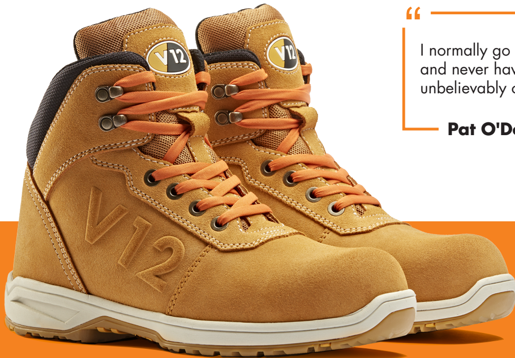
V2150 BoB IGS